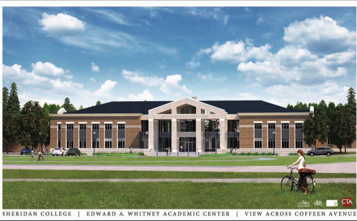
SHERIDAN COLLEGE | EDWARD A. WHITNEY ACADEMIC CENTER | VIEW ACROSS COFFEE AVENUE