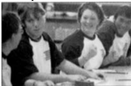
Members of the Kelly Walsh High School Science Bowl team celebrate a correct answer at a competition in February. Education is a 2006 priority for people interviewed for the 'Wyoming Wish List.'