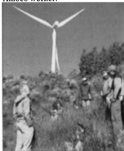
Journalists tour a wind farm near Evanston in July. Energy development was mentioned as a key 2006 topic by 'Wyoming Wish List' participants.